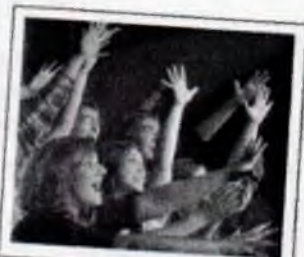
Researchers have identified three kinds of fans

That leaves 2% of young people with a 'borderline-pathological' interest. They might say, for example, they would spend several thousand pounds on a paper plate the celebrity had used, or that they would do something illegal if the celebrity asked them to. These people are in most danger of being seriously disturbed.