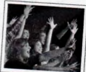
Researchers have identified three kinds of fans

That leaves 2% of young people with a 'borderline-pathological' interest. They might say, for example, they would spend several thousand pounds on a paper plate the celebrity had used, or that they would do something illegal if the celebrity asked them to. These people are in most danger of being seriously disturbed.