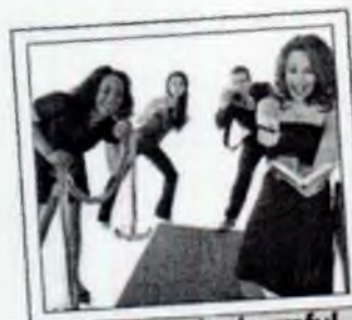
Can fame be harmful to the celebrities?

What about the celebrities themselves? A study in the USA tried to measure narcissism or extreme self-centredness, when feelings of worthlessness and invisibility are compensated for by turning into the opposite: excessive showing off. Researchers looked at 200 celebrities, 200 young adults with Masters in Business Administration (a group known for being narcissistic) and a nationally representative sample using the same questionnaire. As was expected, the celebrities were significantly more narcissistic than the MBAs and both groups were a lot more narcissistic than the general population.