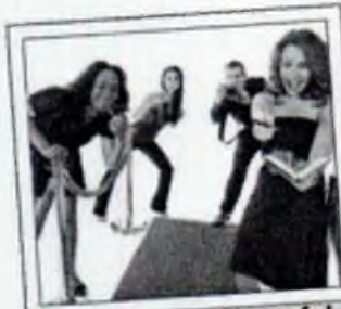
Can fame be harmful to the celebrities?

What about the celebrities themselves? A study in the USA tried to measure narcissism or extreme self-centredness, when feelings of worthlessness and invisibility are compensated for by turning into the opposite: excessive showing off. Researchers looked at 200 celebrities, 200 young adults with Masters in Business Administration (a group known for being narcissistic) and a nationally representative sample using the same questionnaire. As was expected, the celebrities were significantly more narcissistic than the MBAs and both groups were a lot more narcissistic than the general population.