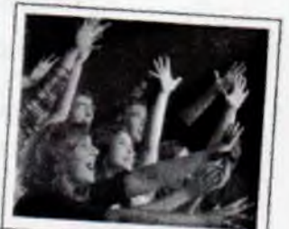
Researchers have identified three kinds of fans

That leaves 2% of young people with a 'borderline-pathological' interest. They might say, for example, they would spend several thousand pounds on a paper plate the celebrity had used, or that they would do something illegal if the celebrity asked them to. These people are in most danger of being seriously disturbed.