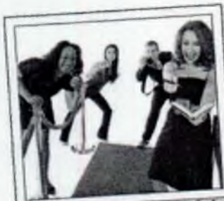
Can fame be harmful to the celebrities?

What about the celebrities themselves? A study in the USA tried to measure narcissism or extreme self-centredness, when feelings of worthlessness and invisibility are compensated for by turning into the opposite: excessive showing off. Researchers looked at 200 celebrities, 200 young adults with Masters in Business Administration (a group known for being narcissistic) and a nationally representative sample using the same questionnaire. As was expected, the celebrities were significantly more narcissistic than the MBAs and both groups were a lot more narcissistic than the general population.